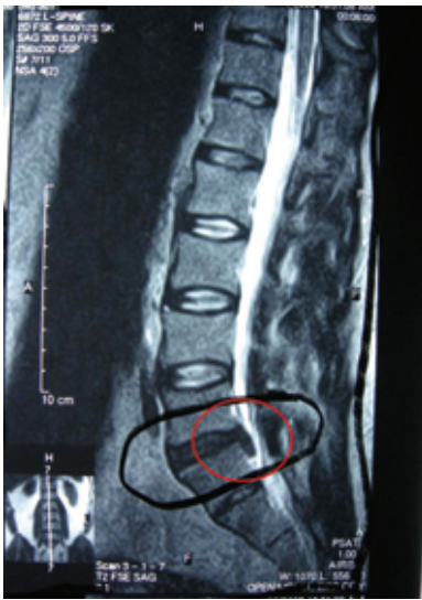
Figure 1a: Pre-treatment MRI (02/02/05)