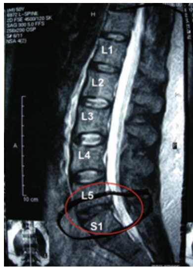
Figure 1b: Post-treatment MRI (14/03/05)